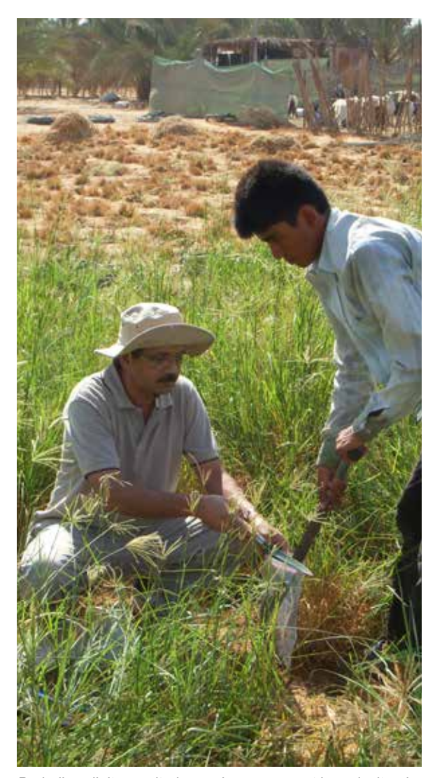
Periodic salinity monitoring and management in agricultural farms is necessary for optimum crop production.

Thematic Area: Assessment of Natural Resources in Marginal Environments