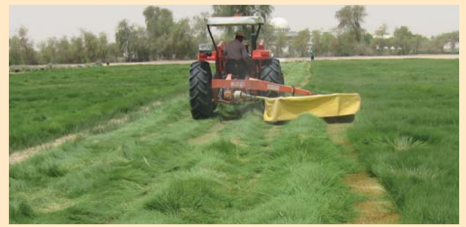
Mechanical harvesting and bailing of the grasses

A number of salinity-adapted species have salt glands or bladders which remove excess saline ions from shoots by excretion. Bicellular leaf epidermal salt glands have been