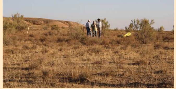
Collection and identification of plant species at the Ecocenter "Dzeiran"

After three years of evaluation, ICBA scientists have been able to introduce two salt-tolerant varieties of alfalfa (Medicago sativa), Eureka and Skeptre, which outperformed the local varieties: Khivinskii (used in Karakalpakstan and Turkmenistan) and Vakhsh (Tajikistan). Only the local variety Kyzylkesekskaya (Uzbekistan) showed similar salt tolerance, green biomass and grain yield compared with the newly introduced alfalfa cultivars in all the CAC countries. The introduced salt-tolerant alfalfa germplasm showed better germination, higher seed production and excellent regenerative capacity. Additionally, these two varieties were better than the local varieties for all the growth parameters studied and also showed higher seed productivity. Fresh biomass production at the third year varied from 23 t ha-1 for var. Eureka and 20 t ha-1 for Skeptre, respectively. These levels of biomass production under saline soils (EC<sub>e</sub>: 1.6-9.1 dS m<sup>-1</sup>) and groundwater salinity (5.6-21.1 dS m<sup>-1</sup>) were 1.5-2.5 times higher when compared to local varieties, such as Khivinsky (in Turkmenistan) and Vakhsh (in Tajikistan).