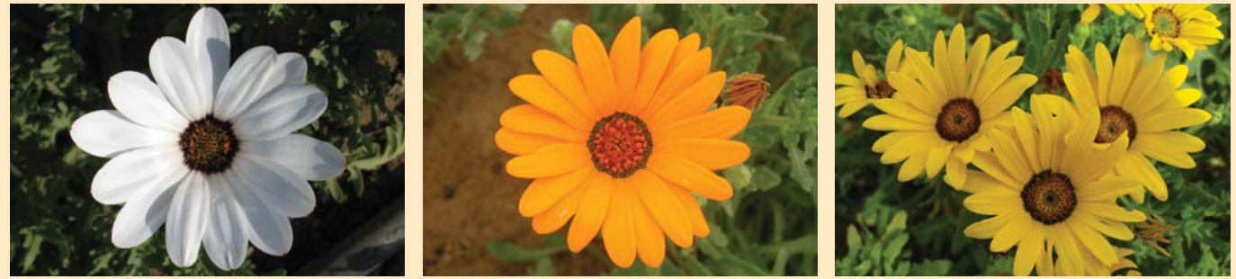
African daisy is excellent for naturalized areas and as a ground cover for large areas, parking strips, borders and even for large pots and tubs. Flowers appear in shades of white, orange and yellow.

The present study indicates that D. aurantiaca has good adaptation to the local growing environment and it could be successfully cultivated with low quality water of up to 10 dS m<sup>-1</sup> salinity. Interestingly, the number of branches and flower diameter are not affected by an increase in salinity, which could make this species an excellent choice for highly saline landscapes and gardens. In this study, seeds were directly sown in the