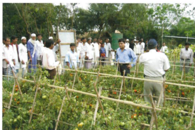
Farmers inspecting tomatoes grown on raised beds with drip irrigation on saline soil at the field day, Noakhali, 24 March

In March a field day attracted over 100 farmers, extension workers, NGO representatives, and BARI scientists. Participants inspected the experiments in the field and saw for themselves the contrast between the experimental area and the surrounding fields left fallow due to salinity.