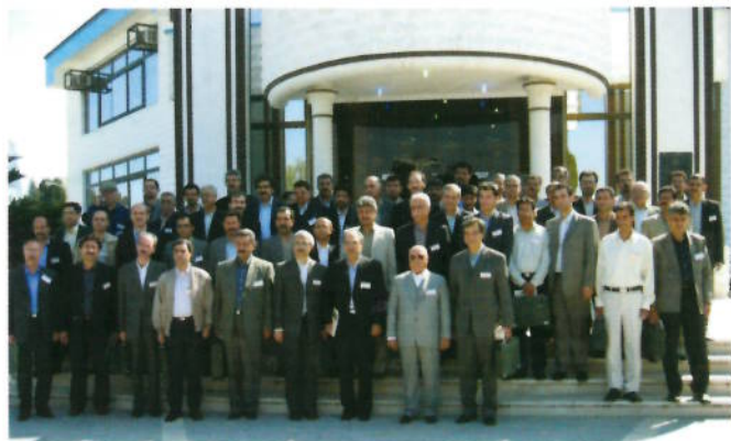
Participants of the workshop, Babolsar, Iran, April

Bank Keshavarzi, a government bank, is the main source of agricultural credit in Iran.