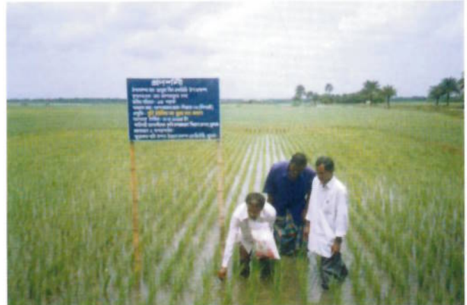
Demonstration of high-yielding rice production in Jabusha Sub-project, Khulna District, southern Bangladesh

Landowners are mainly marginal and small farmers, some of whom rent their land to entrepreneurs for shrimp production. However, the rental income is