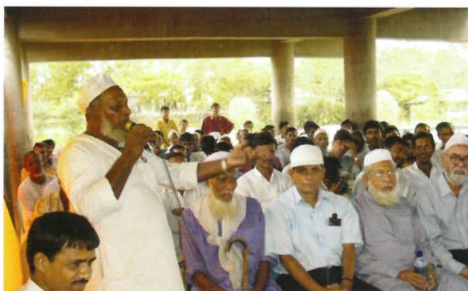
Farmers commenting on the demonstrations at the field day