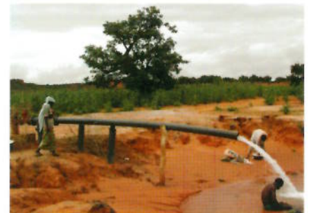
Artesian water with salinity of 6.0-6.7 dS/m at Kizamou, Niger

Activities will focus on strengthening of the capacity of INRAN to deal with salinity problems and will include a training course in Niger, internships at ICBA and pilot projects to demonstrate biosaline agriculture technologies.