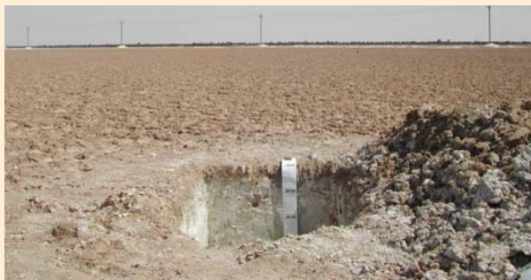
Anhydrite soil and the associated landscape

Anhydrite soil became the focus of the international soil science community when ICBA, EAD and USDA scientists for the first time published an article in 2007 about anhydrite soil in a peer-reviewed USDA publication 'Soil Survey Horizons' with the news about anhydrite being highlighted on the front cover: Anhydrite - really.