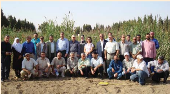
Participants of the workshop during field visits

During their meetings in Damascus, Syria on 9-12 March 2008, the Steering and Technical Committees of the seven-country forage project agreed on organizing several capacity building workshops for the staff of the participating countries. These workshops aim at providing specialists and technicians from Jordan, Oman, Pakistan, Palestine, Syria, Tunisia and the UAE with techniques and knowledge to move ahead in achieving the project's goal to Raise the incomes of the rural poor in the region.