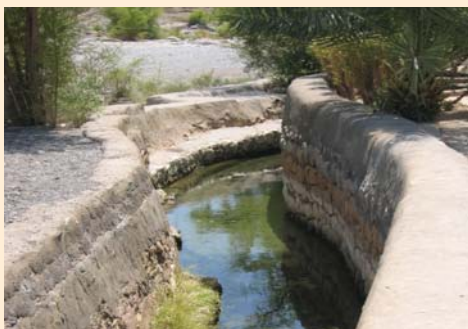
The national strategy aims at conserving water resources in Oman from salinization and pollution

H is Excellency Khalfan Bin Saleh Al Naabi, Deputy Minister of Agriculture Oman, signed a project agreement on 4 January 2009 with Dr Shawki Barghouti, ICBA Director General, to manage a project to formulate a national strategy for