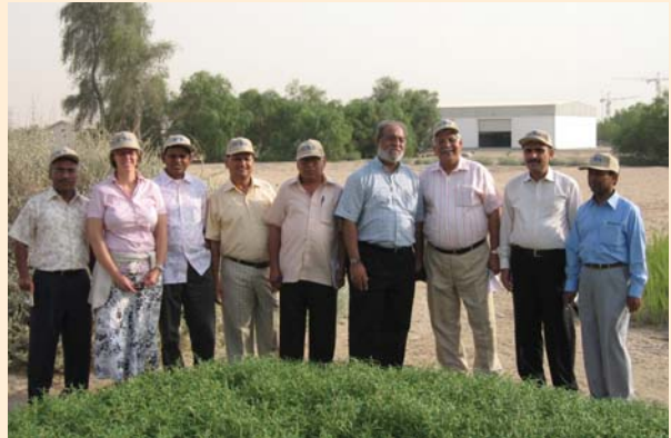
Participants of the workshop touring ICBA fields

The project has different work packages that deal from