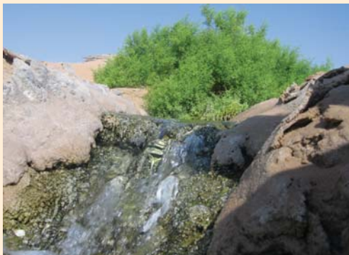
Surface brine disposal on slope of sand dunes