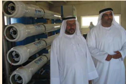
Small RO units in the Eastern region