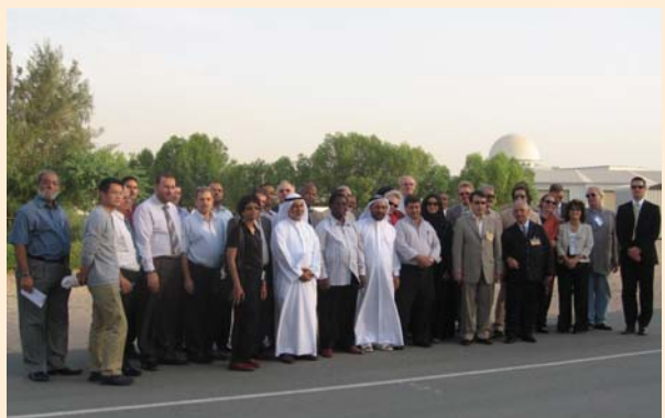
Participants of the meeting at ICBA

The Meeting was organized with the assistance of the UAE's Ministry of Environment and Water and was held in Dubai from 24 to 25 August 2008.