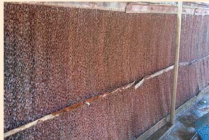
Use of brine in cooling pads of green house