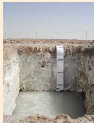
Anhydrite soil originally found

To ensure recognition of anhydrite soil, ICBA and EAD scientists have submitted a formal proposal to the USDA to consider a future change of the soil taxonomy at only three different levels. This is possible as the USDA Soil Taxonomy has been continuously upgraded since its first publication in 1975 through the addition of new orders, suborders, great groups and sub groups.