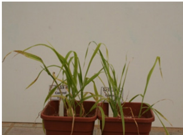
Salt tolerant (left) and salt sensitive (right) barley lines are grown on hydroponic culture under greenhouse conditions to show how salt treatment affects plants.