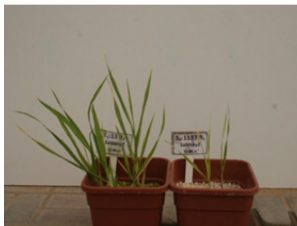
Visible effect of salt stress (#15dSm1-) on plant growth on hydroponic culture under greenhouse conditions. Tolerant line (left), thrives while sensitive line's (right) growth is hindered. This helps to explore the mechanisms of salinity tolerance.

Thematic Area: Crop Productivity and Diversification